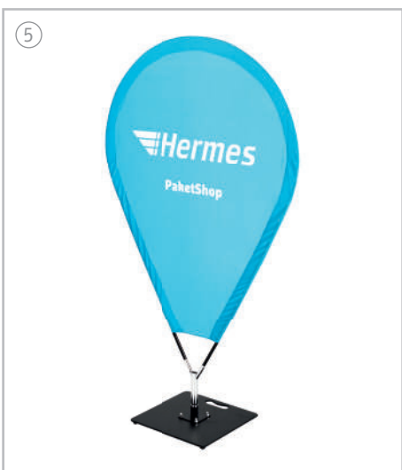
5 Now place the banner with the Y-adapter on the rotating element