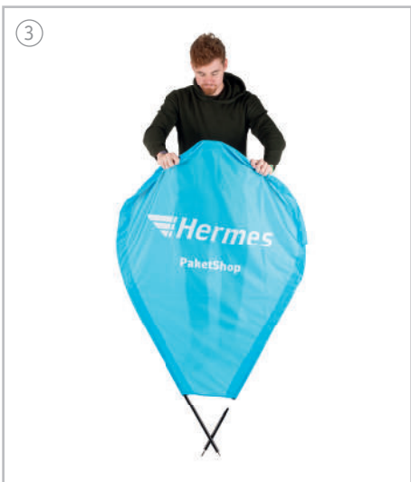
3 Connect the fiberglass rods at the top