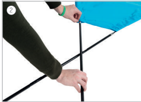
2 Insert the fiberglass rods through the hemstitch