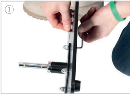
1 Screw the rotating element to the base plate